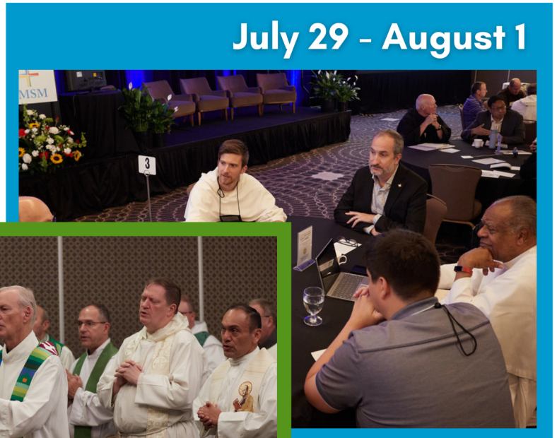
July 29 - August 1